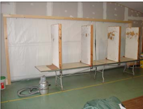
The new curtain on the indoor range.