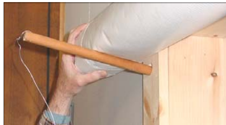
Use the wood peg to hold the curtain.