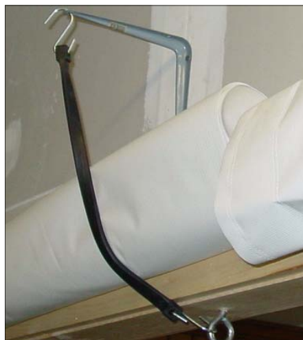
Use the bungee cords to secure.