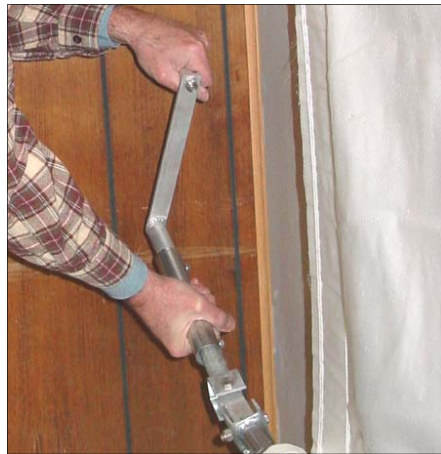
Use the crank to roll the curtain up.