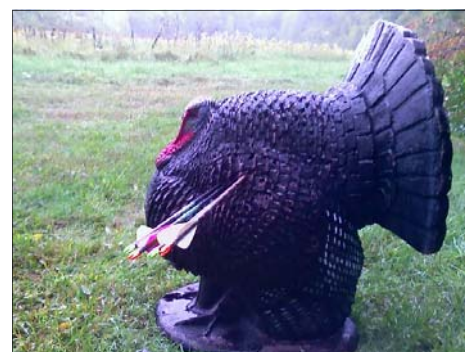
September 28 - The archery competition was as tight as this four shot group.

Only four members came out on the rainy morning of September 28 to participate in the 2008 Archery Championship match. With