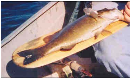
Malcolm Gibson is in 1st place in the Smallmouth Bass Tournament with this 17 1/2" specimen he caught in Belgrade Maine. The fish took a popping plug.

In the smallmouth bass category Malcolm Gibson submitted a 17- 1/2" fish. Also, in the rumor fish department Rolf Briggs claims to have photos of trout he caught in Alaska. We await Rolf's official entry. Remember the tournament runs until January 15th, 2005, with gold, silver, and bronze pins awarded in each category. To enter just submit a picture of the fish you have caught with the size in inches, the date of the catch, place, and method. Entries are posted on the clubhouse bulletin board and updated in the