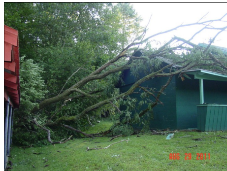
H.S.A. - August 29, 2011 - Tropical storm Irene battered the clubhouse and grounds on Sunday August 28th. She dropped a large tree across the electrical lines above the parking lot (left photo). Another tree fell onto the clubhouse causing roof damage.