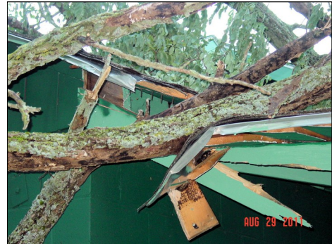
The roof over the outside bar took a heavy hit from this fallen tree limb thanks to tropical storm Irene.